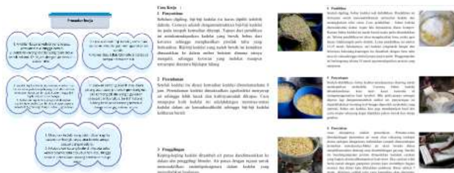
Figure 4. Work Procedure with Clear Instructions.

The research results indicate that the Project-Based Learning (PjBL)–based e-LKPD demonstrates a very high level of practicality according to both students and teachers. This suggests that the e-LKPD is easy to use, efficient, and beneficial in biotechnology learning, as it supports structured, interactive, and project-oriented learning activities. The high level of practicality indicates that the e-LKPD is not only technically feasible but also pedagogically relevant in enhancing students’ engagement, critical thinking, and collaboration (Keleman, 2021; Simamora & Hajar, 2025). The results of teacher interviews further reinforce these findings, as teachers stated that the e-LKPD is systematically organized, with clear and well-integrated project steps. Consequently, it supports directed, effective, and meaningful learning while facilitating the optimal achievement of learning objectives (Dwi Rahmayani et al., 2024; Sujinah & Yanah, 2024).