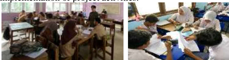
Figure 2. Teacher Assistance During the Learning Process.

In terms of the time aspect, the PjBL-based e-LKPD also demonstrated a very high level of practicality. The e-LKPD helps students manage their learning time more effectively through clear instructions, structured learning activities, and flexible learning processes. This finding is consistent with previous studies stating that instructional materials can improve time efficiency in learning (Barakat et al., 2024; Wang et al., 2025). However, interview results revealed that in certain practicum components, such as determining fermentation time and implementing work procedures, teacher guidance was still required (Figure 2). This indicates that although the e-LKPD is practical, the teacher’s role remains essential as a facilitator in the implementation of project activities.