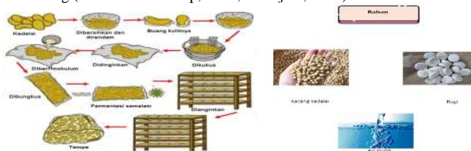
Figure 1. The e-LKPD Equipped with Illustrations

The usability aspect obtained a percentage of 84%, categorized as very practical, because the e-LKPD is easy to operate and systematically organized. The results of student interviews support this finding, as they stated that the project steps were explained sequentially, easy to understand, and encouraged them to be more active and challenged in completing the practicum. This indicates that the e-LKPD facilitates students' direct engagement in the learning process. This finding is consistent with previous studies suggesting that e-LKPD should support students in becoming more active during learning (Huda et al., 2023; Wahyu Mulyasari, 2022). The presentation aspect obtained a percentage of 81%, categorized as very practical, because the material is presented in a structured manner and supported by illustrations (Figure 1), which help students understand biotechnology concepts more deeply. This is also supported by previous research stating that digital instructional materials enriched with multimedia elements can increase students' interest in learning (Amelia & Harahap, 2021; Gilakjani, 2012).