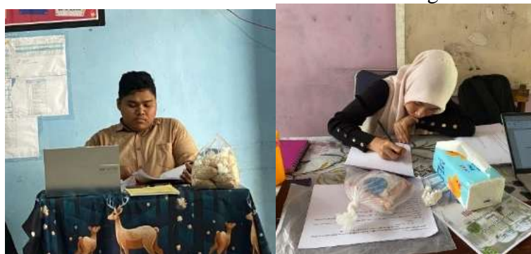
Figure 6. Completion of the Observer Questionnaire

The implementation results obtained from the observers (Figure 6) indicate a very good category, with an average percentage reaching 94%. This shows that each stage of the learning process was carried out in accordance with the steps of Project-Based Learning. It also demonstrates that the e-LKPD was effectively implemented throughout all phases of the lesson, from the introduction to the core activities and the closing.