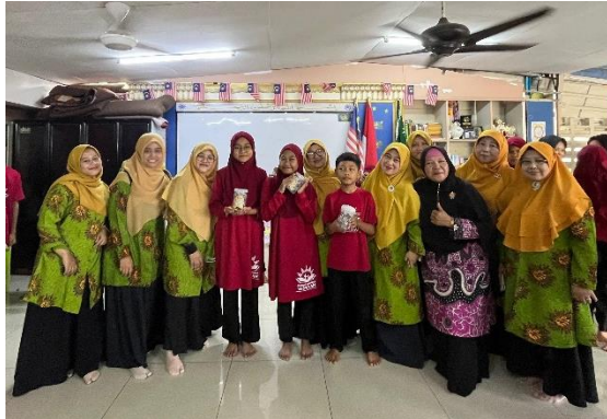
Figure 6. Awards for the Best Group and Best Participant