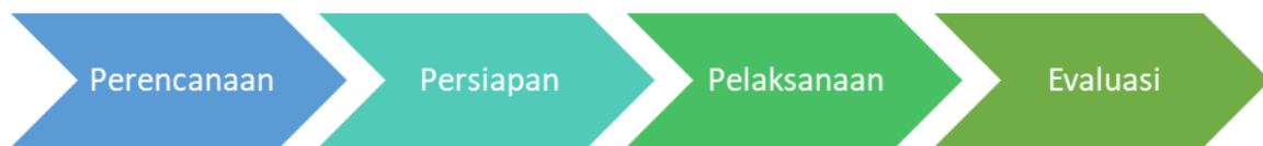
Figure 1. Stages of Service Implementation

This approach has increased participant participation and understanding in leadership training programs. The implementation stages ensure that each participant gets an optimal learning experience—Figure 1. Explain the method or stages in the implementation of this service activity.