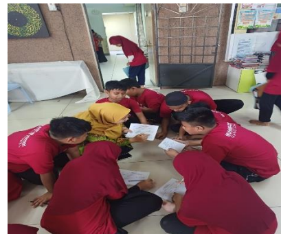
Figure 7. Implementation of Feedback Activities from Participants and Teachers

The following evaluation results show that participants better understand the leader's criteria before and after the training. The following table shows participants' level of understanding of the leader's criteria: