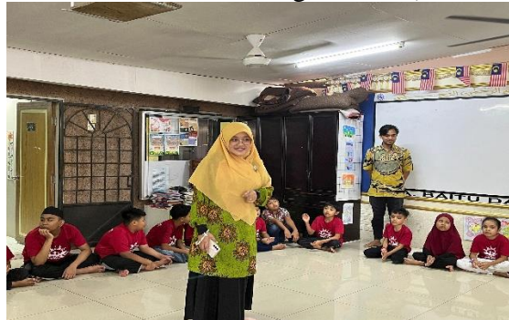
Figure 2. Icebreaking with Migrant Children

The session begins with ice-breaking designed to melt the atmosphere, build familiarity, and foster spirit within the group. Activities like name games and creative introductions foster confidence and create a safe and inclusive learning climate (Creswell, 2007).