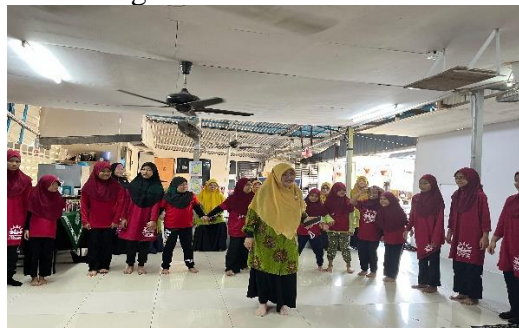
Figure 3. Motion and Focus Games