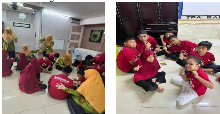
Figure 5. Discussion of Interaction Results of Working on Puzzles