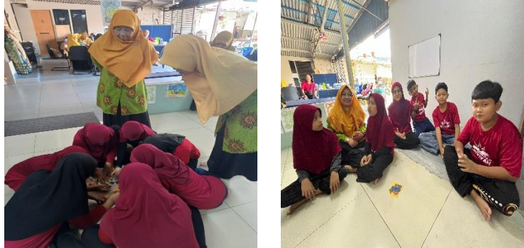
Figure 4. Putting Together Puzzles Per Group

to instill values such as honesty, responsibility, and a spirit of service that can be exemplified daily.