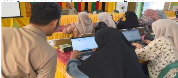
Figure 2. Chat-GPT and Gemini AI utilization training.

After the socialization material, training activities on preparing learning tools utilizing AI technology continued. The learning tools emphasized in this training are teaching modules. Teaching modules were chosen as the main topic because they represent a new approach to the Merdeka curriculum (Jannah & Irtifa'Fathuddi, 2023). As a substitute for lesson plans in the previous curriculum, teaching modules require adjustment and optimization to align with the latest curriculum and current conditions, ensuring that classroom learning is maximized. The AI technologies used in the training activities are the ChatGPT and Gemini AI applications. Both ChatGPT and Gemini AI are relevant tools that facilitate the process of compiling and locating learning resources (Zhai et al., 2021). Additionally, these applications can assist teachers in designing interactive learning scenarios and fostering discussions in the classroom through the integration of various learning models (Jumriah et al., 2024). Thus, teachers can more easily innovate when preparing learning tools