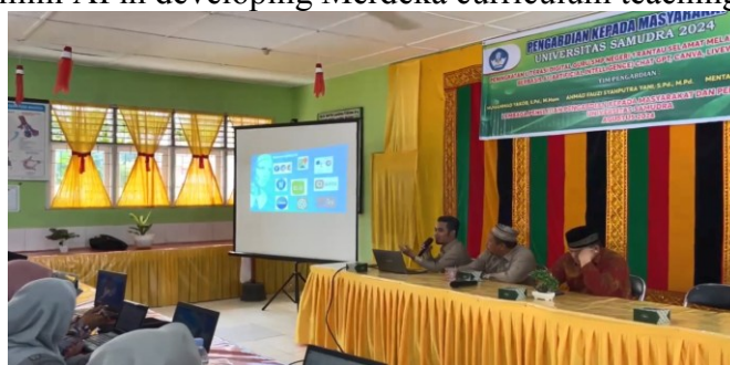
Figure 1. Socialization of Artificial Intelligence Technology for Developing teaching modules.

Before the socialization activities were carried out, the teachers were given a pre-test of 20 questions to find out the teachers' initial knowledge of learning tools in Merdeka curriculum and teachers' digital literacy regarding Artificial Intelligence technology. The next activity is a socialization activity carried out by the service team by providing material about Merdeka curriculum learning tools and the use of AI technology in preparing learning tools. The socialization materials are: (1) Learning tools on Merdeka curriculum. (2) Teaching modules for Merdeka curriculum. (3) Definition of Artificial Intelligence. (4) The potential of artificial intelligence (AI) to improve learning. (5) AI platforms in Education. (6) Utilization of Chat GPT and Gemini AI in developing Merdeka curriculum teaching modules.